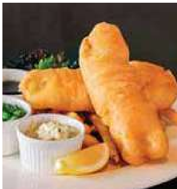
SUSTAINABLE COD AND CHIPS A17 英式炸鱈魚及薯條 $138