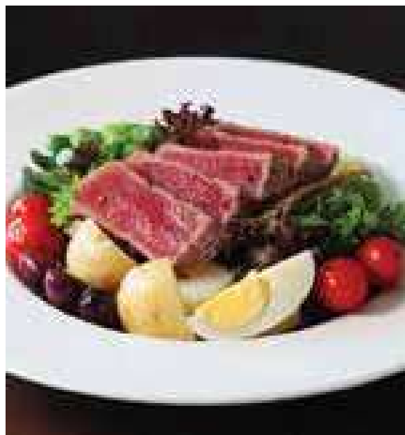
SEARED TUNA NICOISE SALAD A01 法式吞拿魚雜菜沙律 $108

Seared Tuna, Green Beans, Potatoes, Olives, Tomatoes, Hard-boiled Egg, Vinaigrette Dressing 吞拿魚、青豆、馬鈴薯、橄欖、番茄、焗蛋、油醋沙律汁