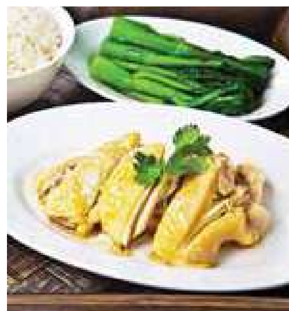
HAINANESE CHICKEN WITH FLAVOURED RICE AND SOUP OF THE DAY A18 海南雞飯伴精選熱湯 $138

Made completely from plants, the burger patty is gluten-free but contains soy, coconut oil and potato Impossible™ 漢堡由百分百植物製成，不含麩質，包含大豆、椰子油和馬鈴薯