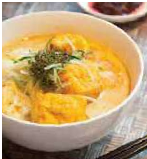
LAKSA LEMAK A20 星洲海鮮雞肉喇沙 $118