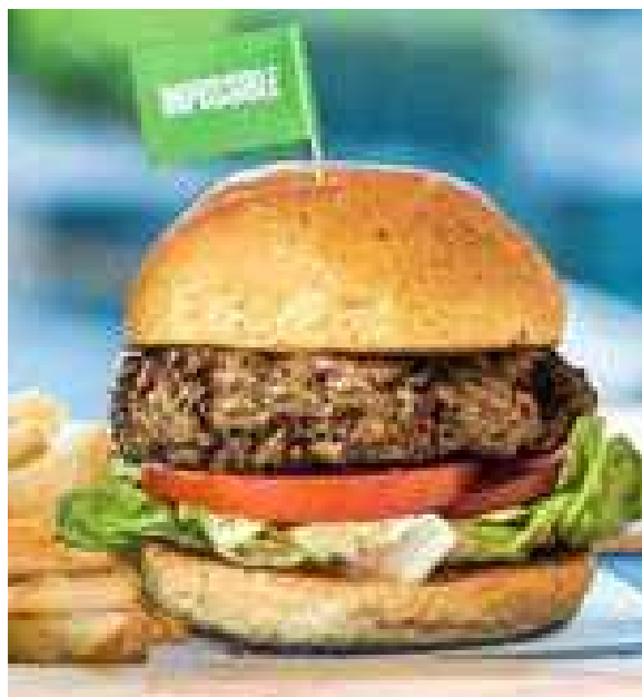
IMPOSSIBLE™ BURGER 2.0 & GREEN SALAD (V) A10 IMPOSSIBLE™漢堡2.0 伴雜菜沙律 $138

Seared Tuna, Green Beans, Potatoes, Olives, Tomatoes, Hard-boiled Egg, Vinaigrette Dressing 吞拿魚、青豆、馬鈴薯、橄欖、番茄、焗蛋、油醋沙律汁