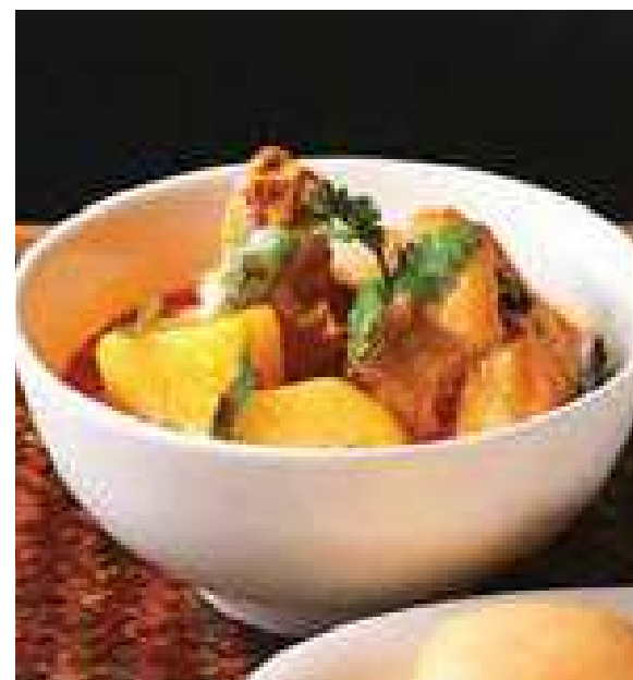
SINGAPOREAN CHICKEN CURRY SERVED WITH STEAMED RICE A19 星洲椰汁咖喱雞伴白飯 $118